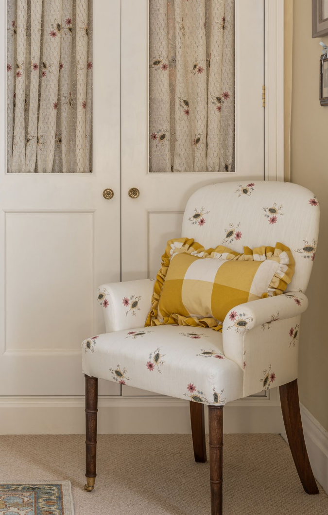
Printed Floral - Sprig Meadow