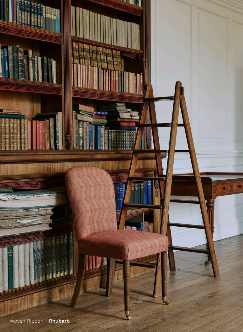
Woven Ribbon - Rhubarb