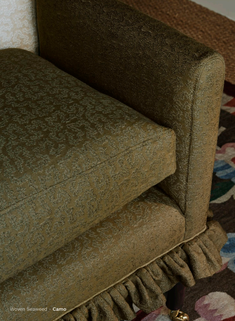
Woven Seaweed - Camo