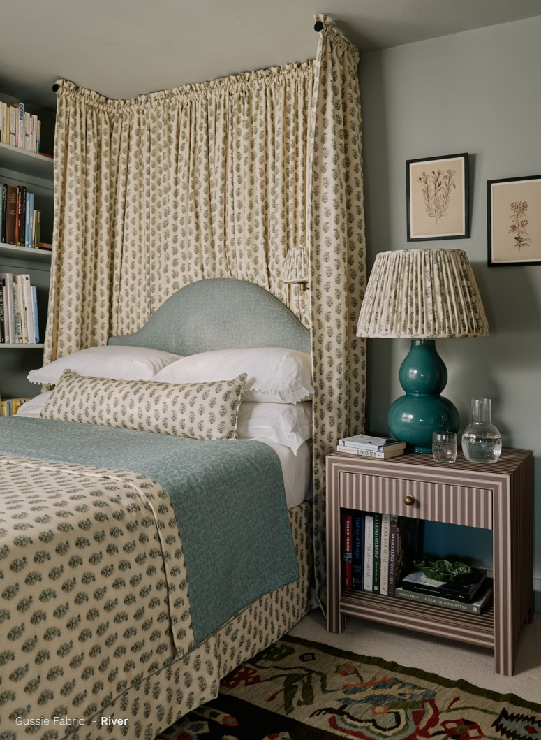
Cussie Fabric - River