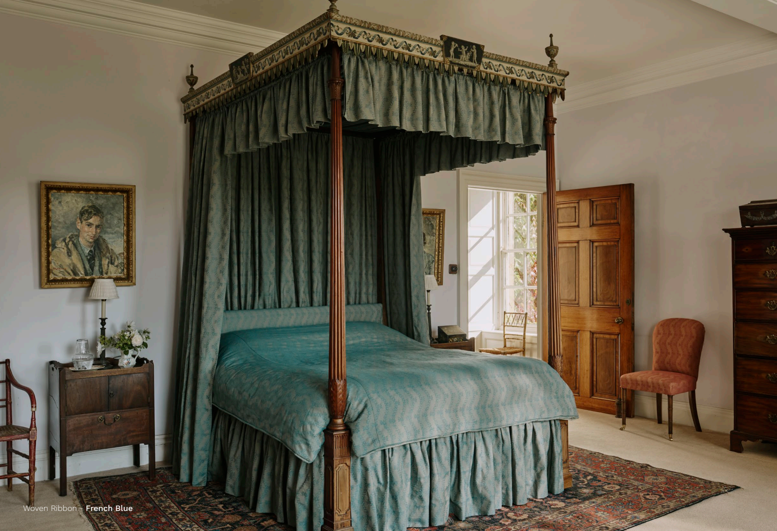
Woven Ribbon - French Blue