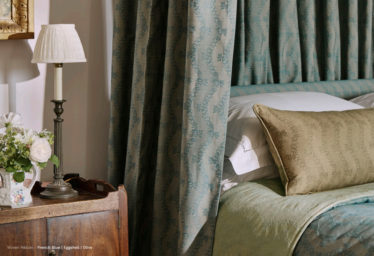
Woven Ribbon - French Blue | Eggshell | Olive