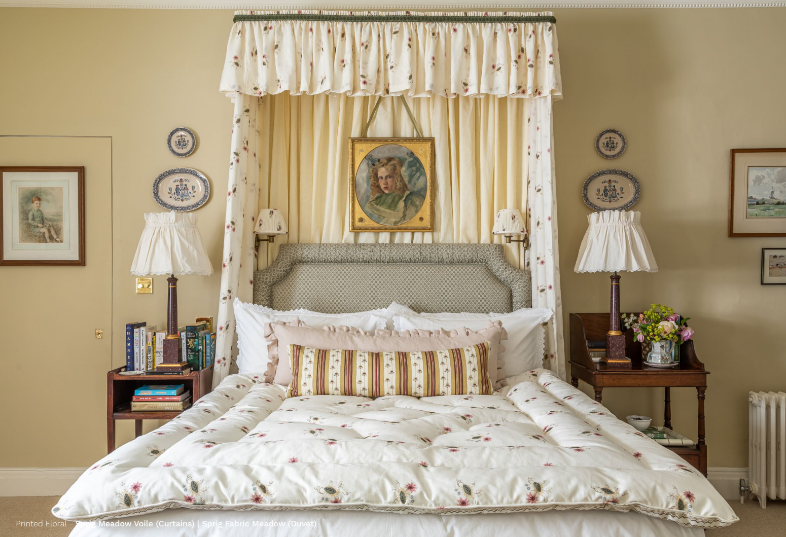
Printed Floral - Sprig Meadow Voile (Curtains) | Sprig Fabric Meadow (Duvet)