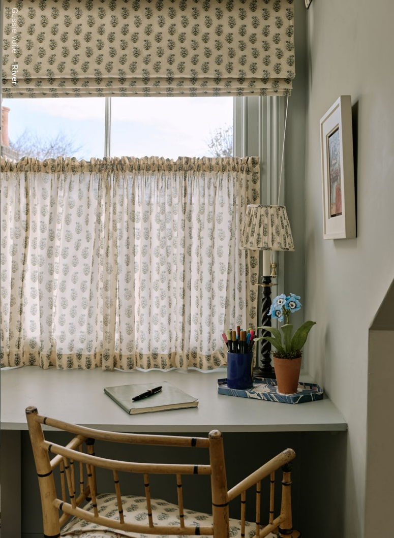
Cussie Fabric - River