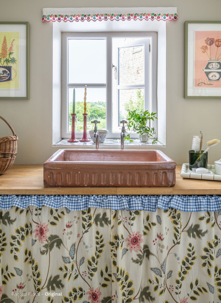
Printed Floral - Original