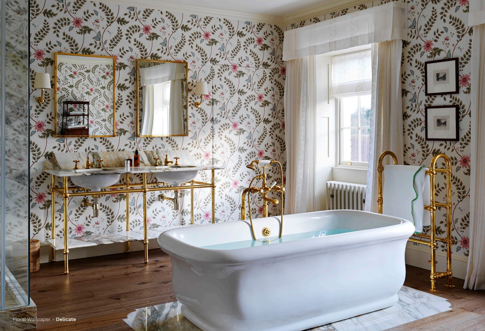
Floral Wallpaper - Delicate