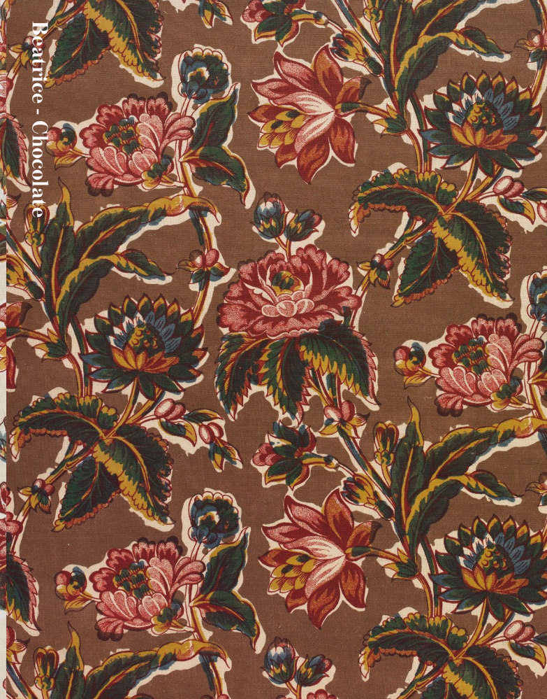
Beatrice - Chocolate

Repeat: W22.8 x H29.3 cm (Half Drop Repeat)