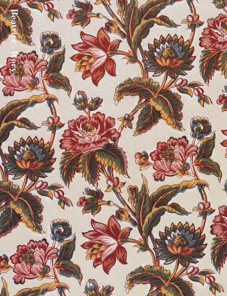
Beatrice - Ivory