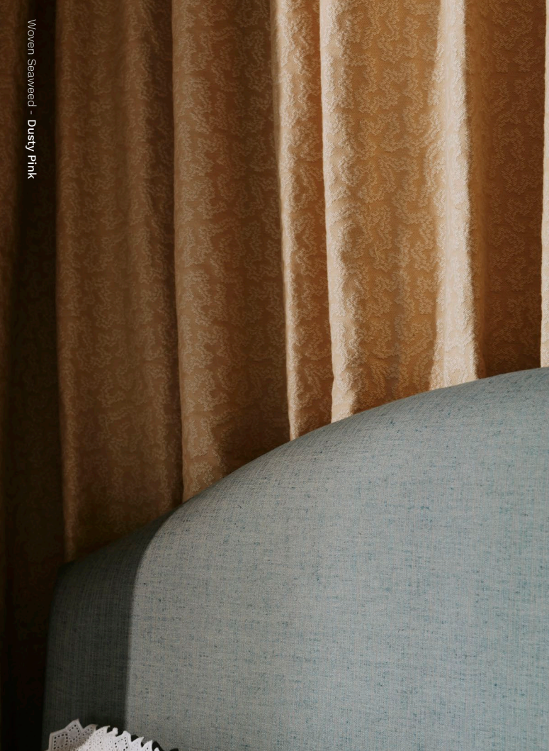
Woven Seaweed - Dusty Pink